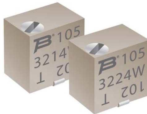
New 3214/3224 Color

If you have any questions, please feel free to contact Bourns Customer Service .