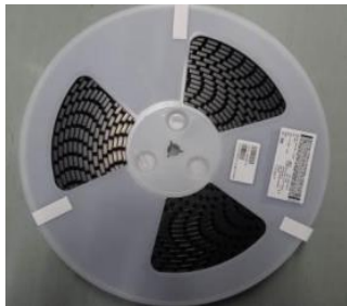
Current (without inner box)